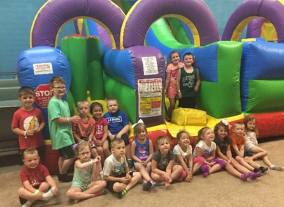
Logan Elementary celebrated end of the school year at The Jump House.