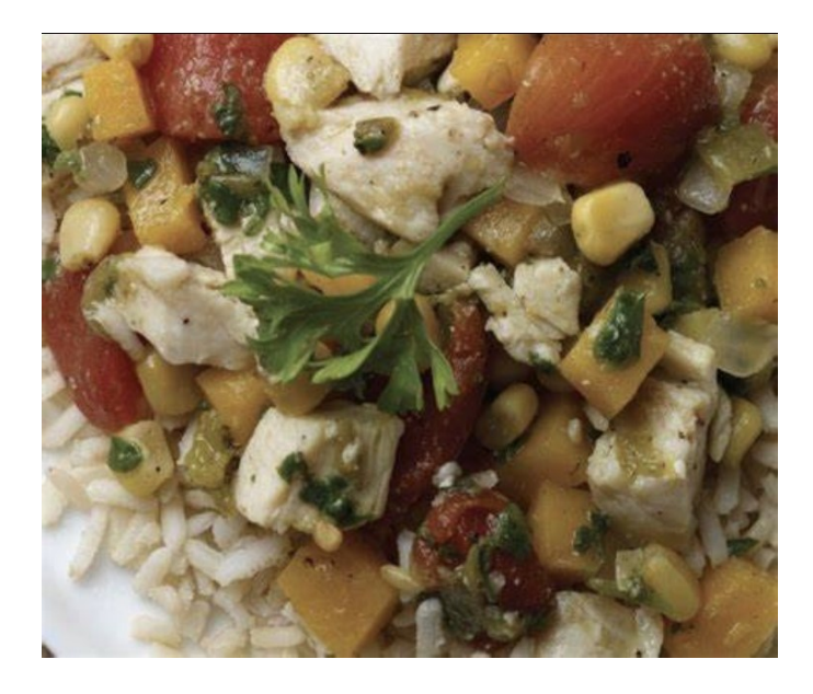
Preparation Time: 30 minutes; Cook Time: 1 hour

3/4 cup stir-fry and 1/2 cup brown rice provides 1 1/4 oz. equivalent meat, 3/4 cup vegetable, and 1 oz. equivalent grains (Makes 6 servings)