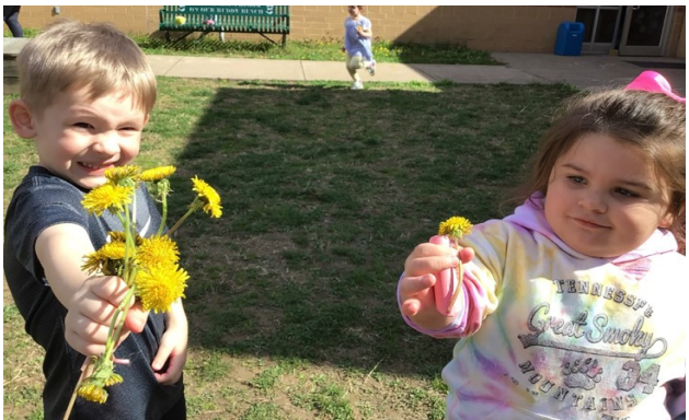
Man Elementary Head Start children explored nature and practiced their fine motor skills on a brand new dry erase table.